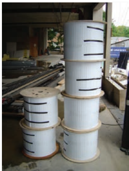
Riser MicroDucts ship on small, easy to handle reels

* Unsupported Bend Radius guidelines should be followed during the installation process. The Supported Bend Radius are post-installation measurements. † Safe working pull strength is calculated at 80% of tensile or breaking strength