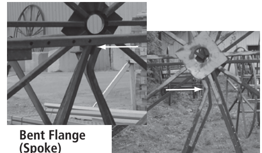
Bent Flange (Spoke)