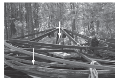
Cracked Weld & Bent Flange (Spoke)